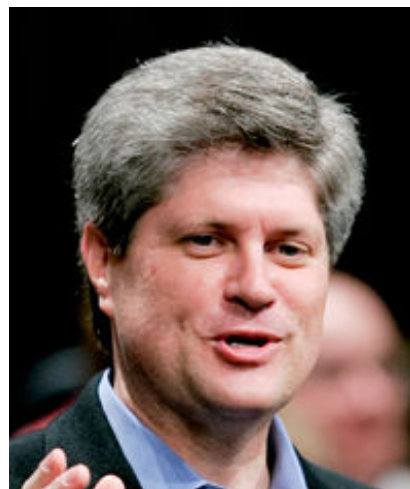
Rep. Jeff Fortenberry

“Be angry with me, direct your protest at me, but do not frighten my children in their home,” said Fortenberry, who posted the comment and a picture of the sign Thursday on his Facebook page and on Twitter.